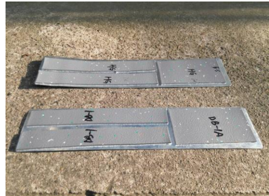
Application for PVC floor bonding

Notes: The information contained on above data sheet is, to the best of our current knowledge, true and accurate. However, since the conditions of use are beyond our control, all recommendations or suggestions are presented without guarantee or responsibility on our part. We disclaim all liabilities in connection with the use of information contained herein or otherwise. All risks of such nature are assumed by the user.