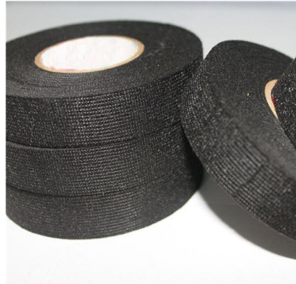
Wire harness Tape for automobile